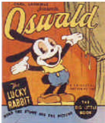
Figure 1 –1927 - Before Mickey there was Oswald. Oswald was designed by Walt Disney and Ub Iwerks, and his first cartoon "Trolley Troubles" was released in 1927. Walt lost the rights to Oswald, and developed Mickey Mouse as a replacement character.

And the current TerraCuddles products? Collector's items! Better buy them now!