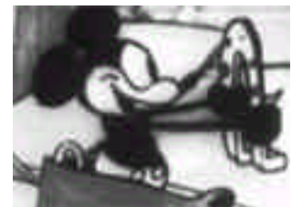
Figure 3 – 1928 - Steamboat Willie premiered at the Colony Theater in New York on November 18th 1928. Seven and a half minutes long, the cartoon drew better reviews than the major full-length films released that week. Within weeks Mickey Mouse was a nationwide sensation. Three years later and he would be a national institution.